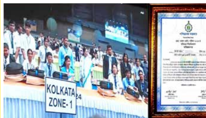
The Honourable Chief Minister of West Bengal Smt. Mamata Banerjee with students of DPS Megacity.