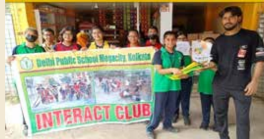
CARE FOR COMFORT AND CONFIDENCE : DONATION OF SLIPPERS