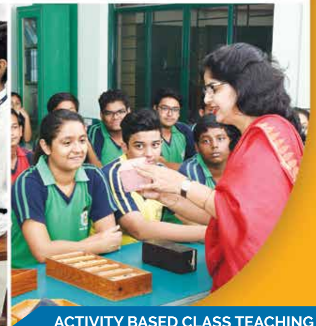
ACTIVITY BASED CLASS TEACHING