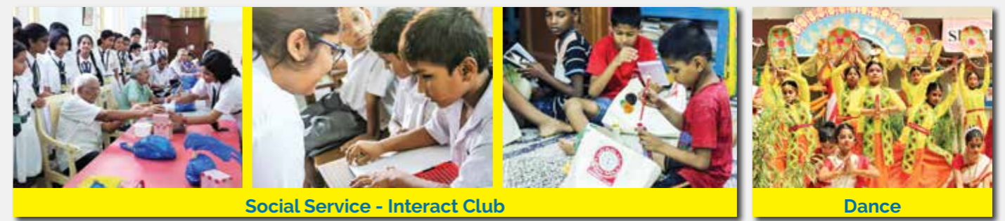
Social Service - Interact Club