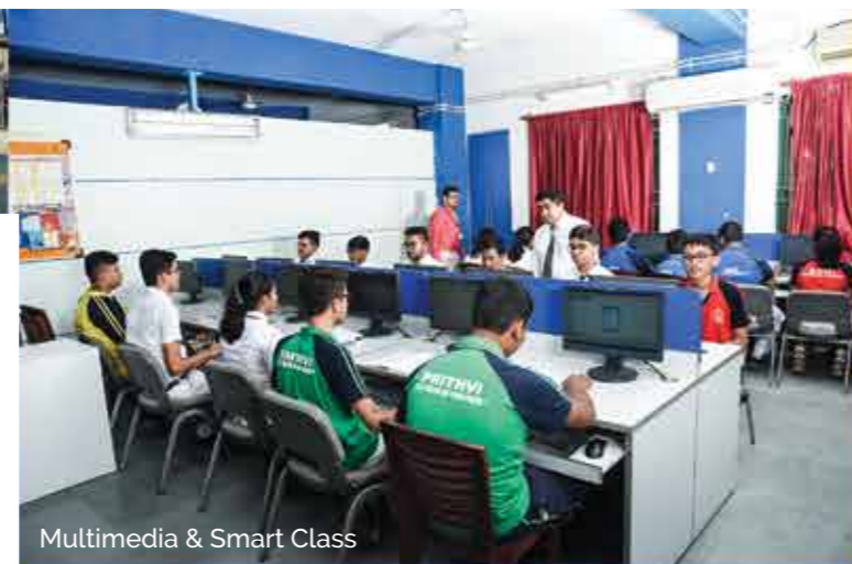
Multimedia & Smart Class