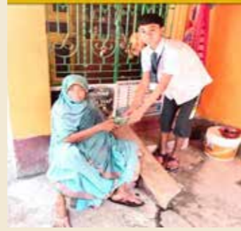
JOY OF GIVING