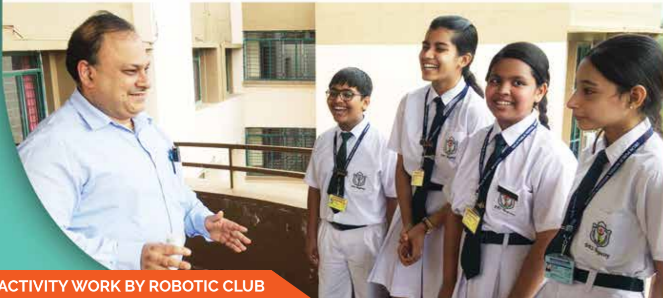
ACTIVITY WORK BY ROBOTIC CLUB