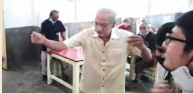
'EYES- THE MIRRORS OF LIFE' A FREE EYE CHECKUP CAMP