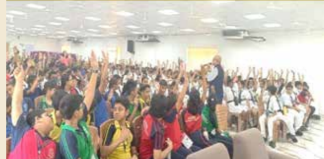
MAA - MOTHERS' APT APPRECIATION : CONCERN FOR SENIOR CITIZENS