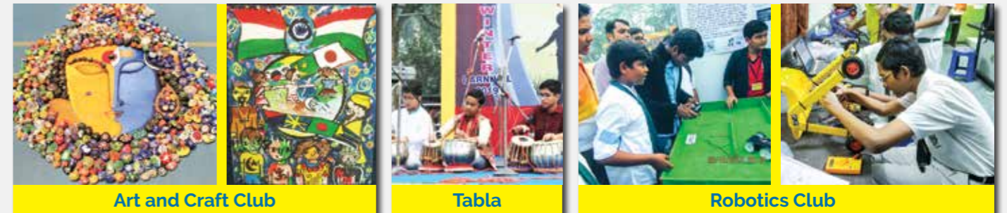
Art and Craft Club