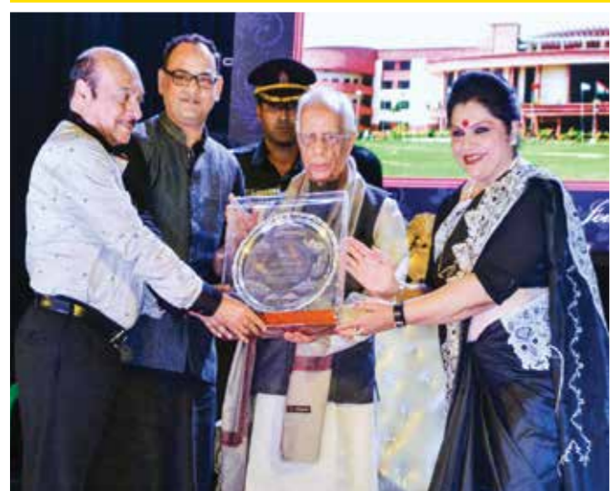
The Honourable Ex Governor of West Bengal & Bihar- His Excellency, Shri Keshari Nath Tripathi at the 13th Annual Day Programme of DPS Megacity, Kolkata.