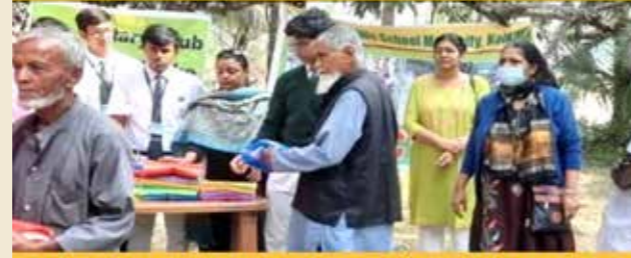
300 MOSQUITO NETS WERE DISTRIBUTED AMONG THE POORER SECTION OF THE SOCIETY