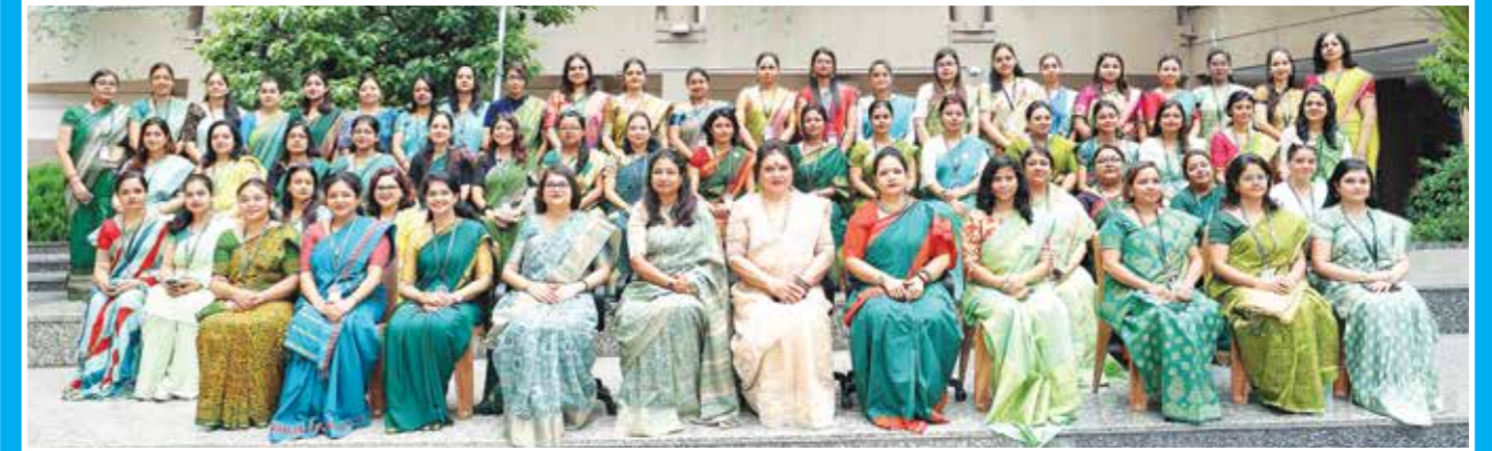
Pre Primary Teachers