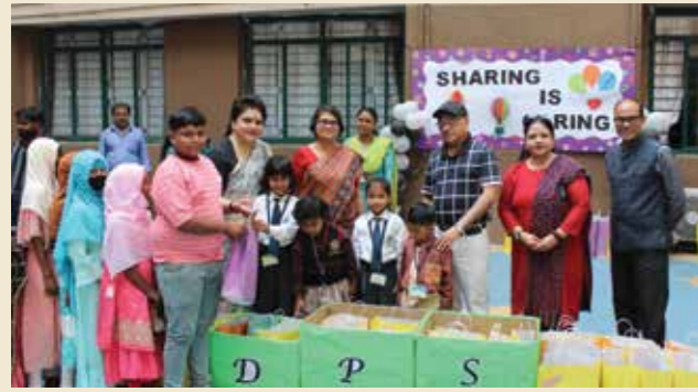
Sharing is Caring