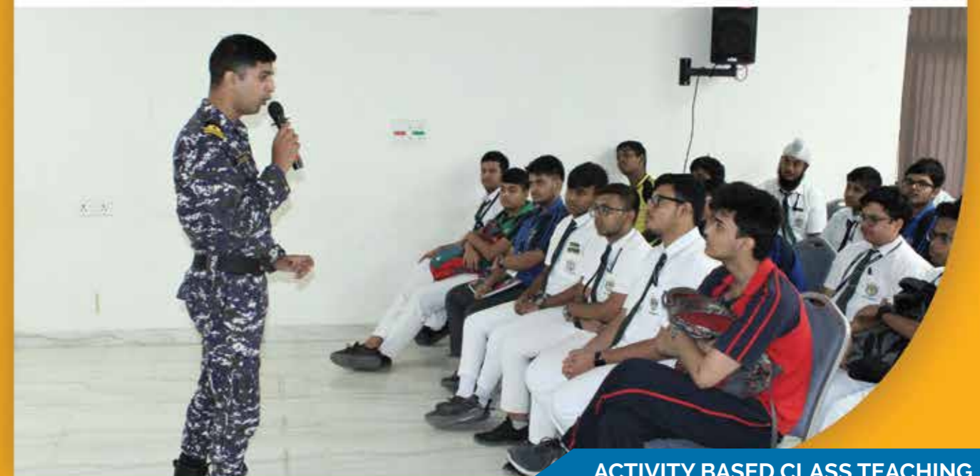
ACTIVITY BASED CLASS TEACHING