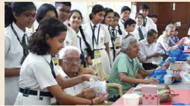
Spreading joy in an Old Age Home