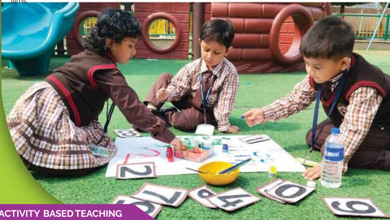
ACTIVITY BASED TEACHING

Nursery to Class I - From 9:30 am to 1:15 pm (Monday to Friday) (Timing is subject to change)