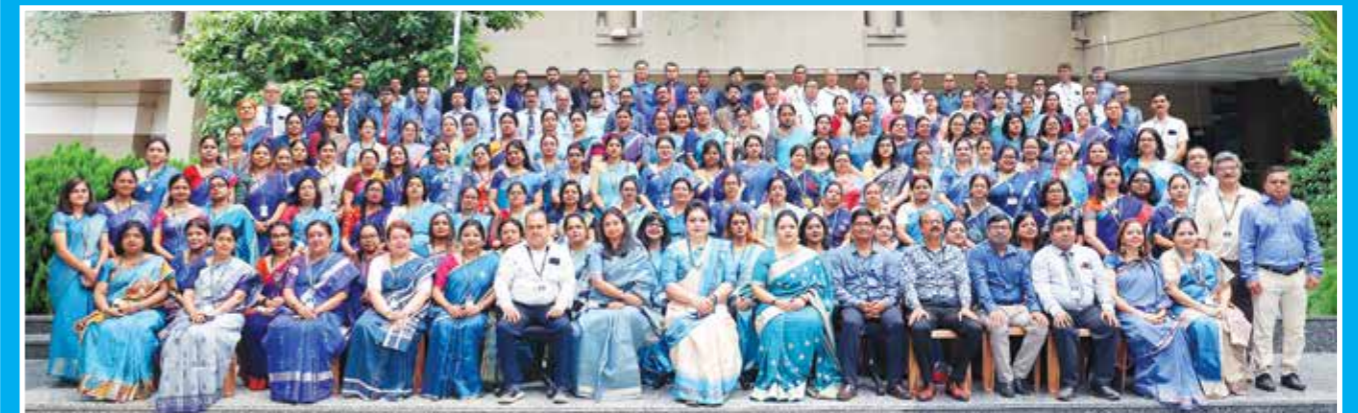
Middle & Senior School Teachers