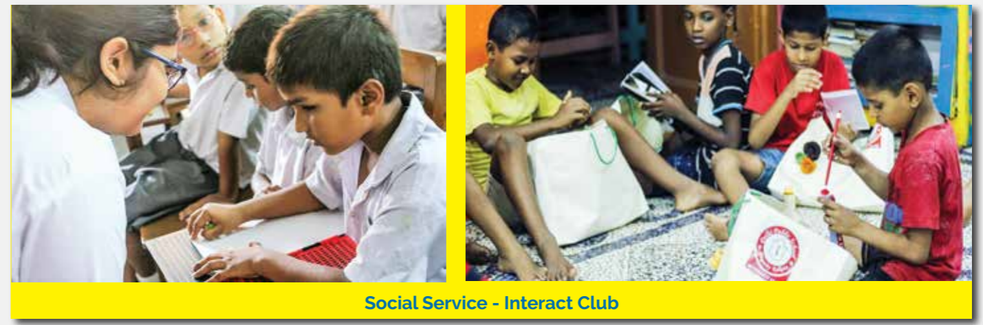
Social Service - Interact Club