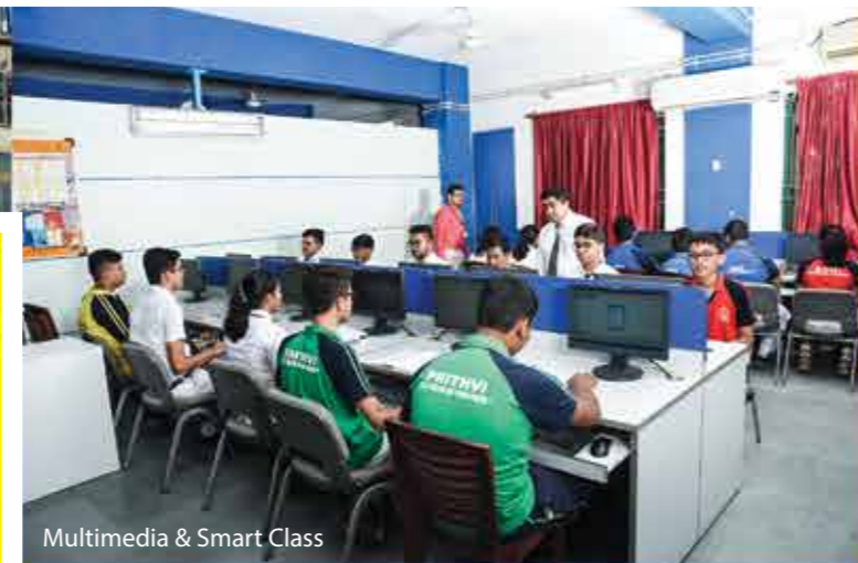
Multimedia & Smart Class