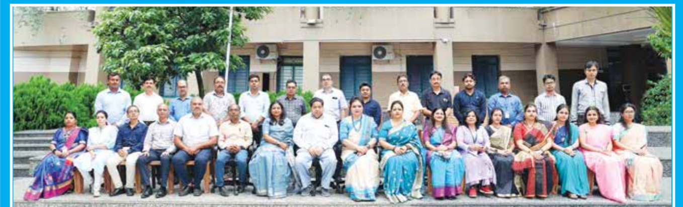
Our Administrative Team