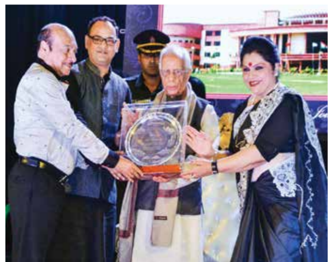
The Honourable Ex Governor of West Bengal & Bihar His Excellency, Shri Keshari Nath Tripathi at the 13th Annual Day Programme of DPS Megacity, Kolkata.