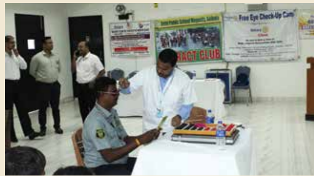
Eye Check Up