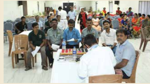
Health Awareness Camp