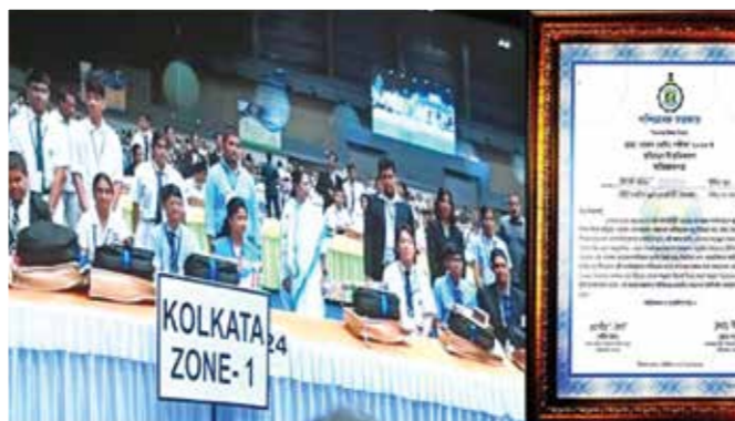
The Honourable Chief Minister of West Bengal Smt. Mamata Banerjee with students of DPS Megacity.