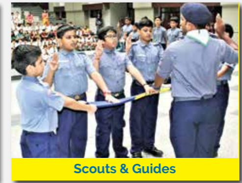
Scouts & Guides