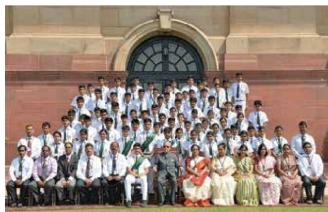
Students & Teachers of DPS Megacity with Ex President of India Mr. Pranab Mukherjee.