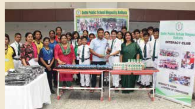
Spreading Joy amongst our staff