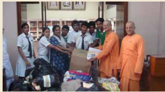
A visit to Ram Krishna Mission