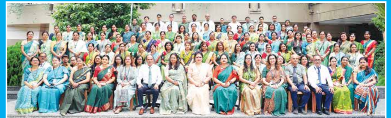
Junior School Teachers