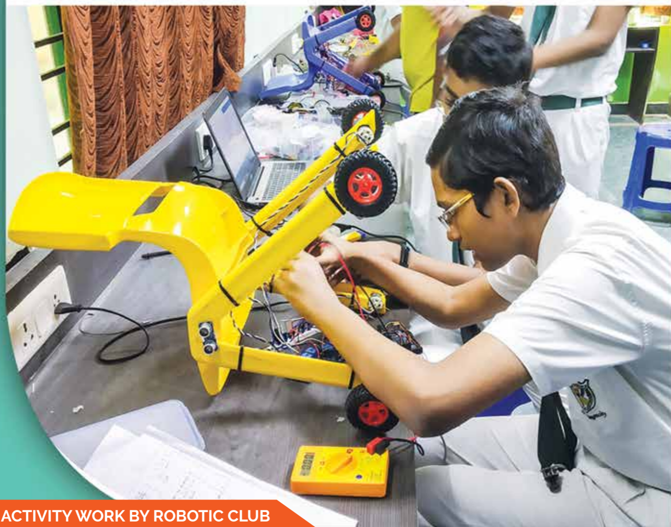
ACTIVITY WORK BY ROBOTIC CLUB

Note: 40 minutes extended time for games and extra-curricular activities for classes during zero period.